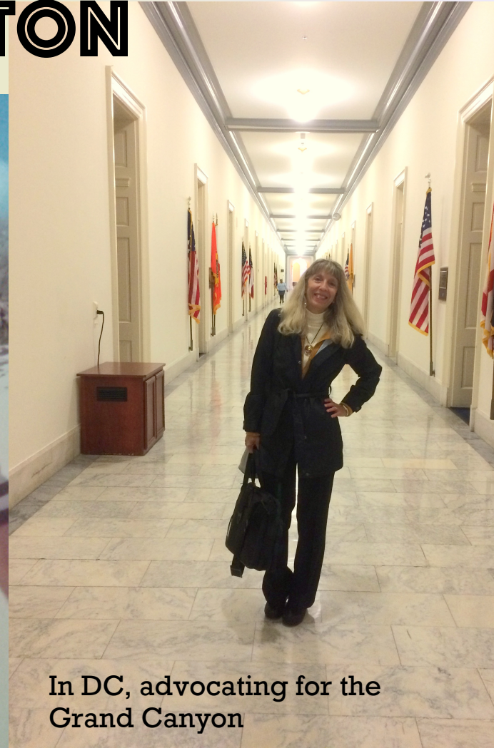
In DC, advocating for the Grand Canyon