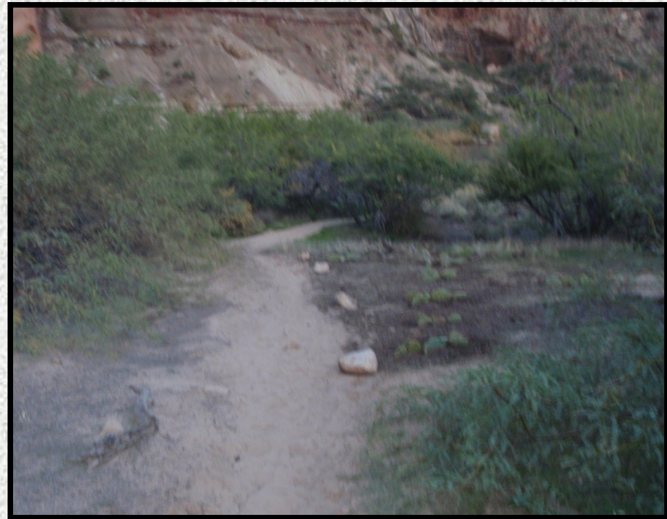
Post-work, November 2010. Trail leading to drainage from downstream end of camp.