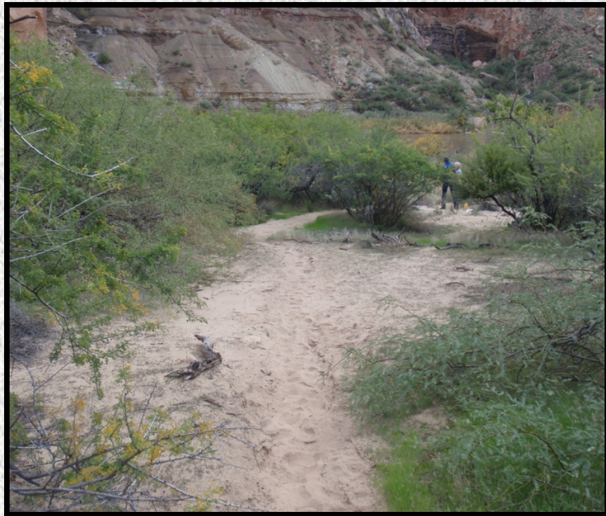
Pre-work, November 2010