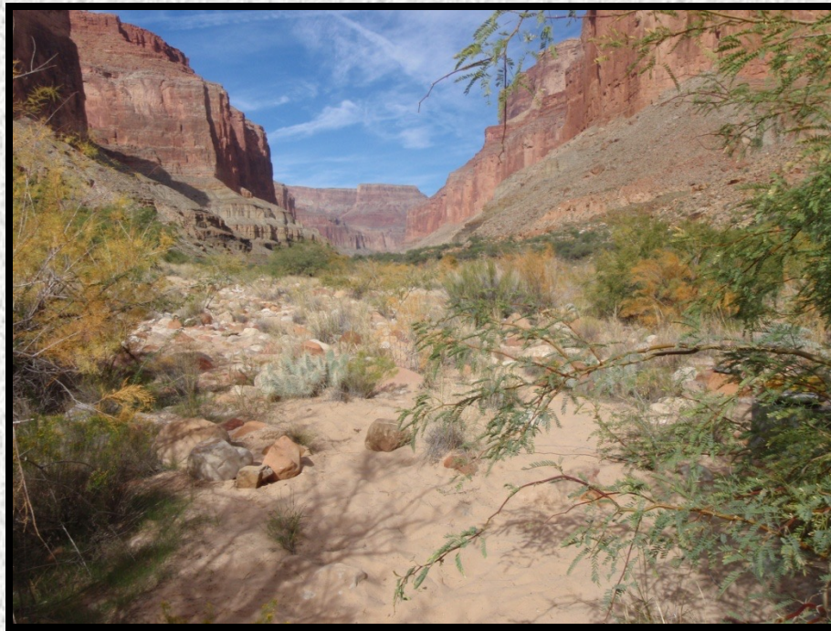
Pre-work, November 2010