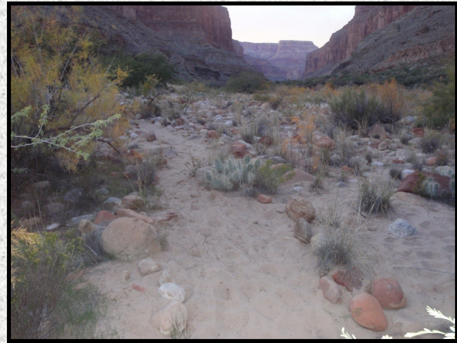
Post-work, November 2010. Trail leading to drainage from upstream end of camp.