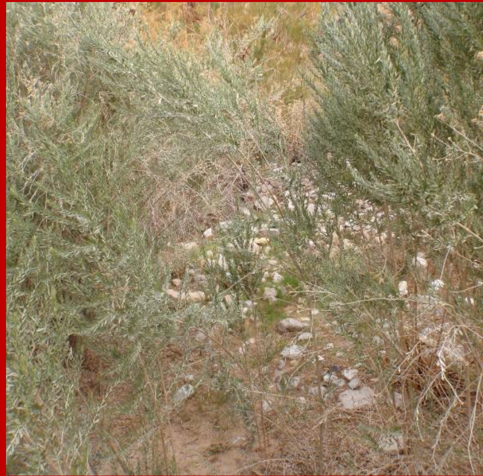
Same staircase, Feb 2010