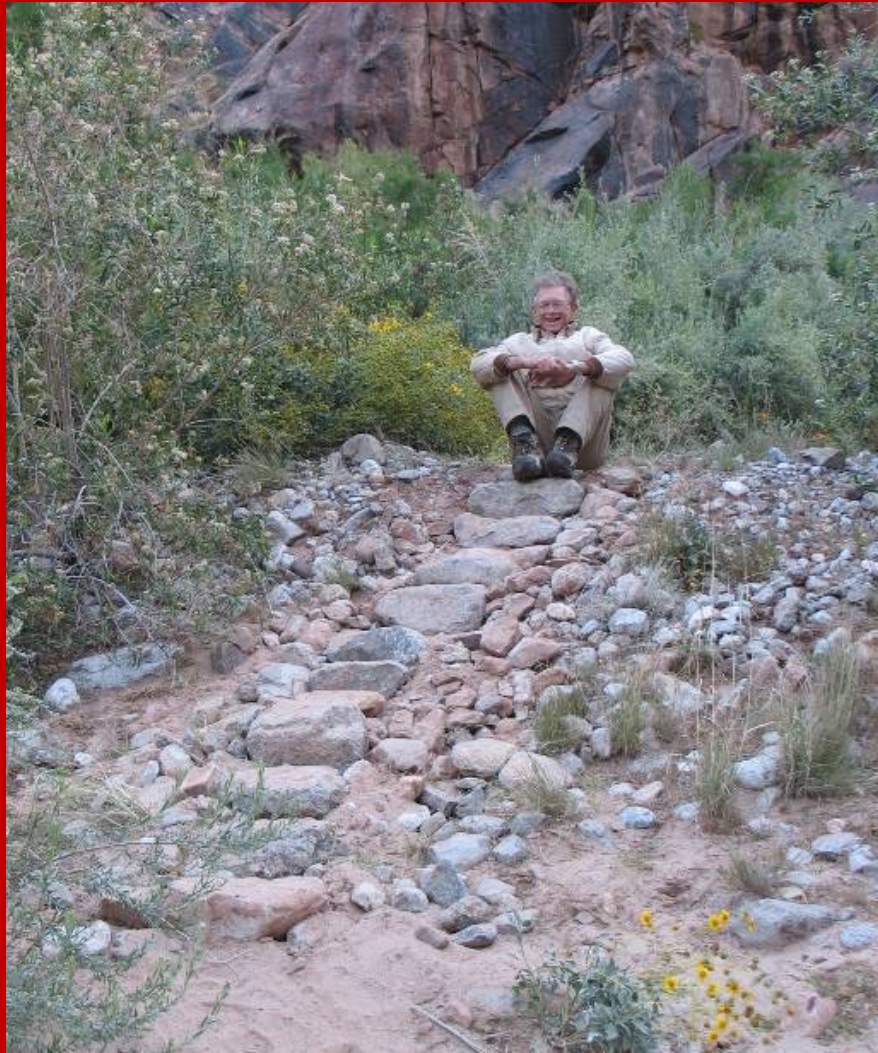
Post work GTS April 2009